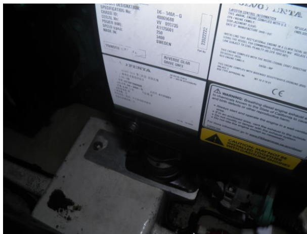
Exhaust and fuel systems in good condition.