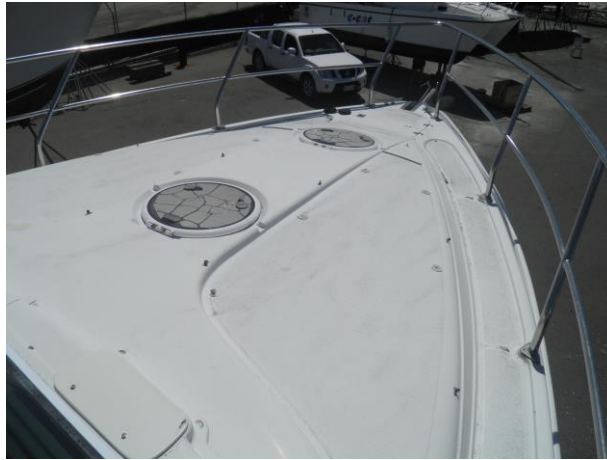
m.v. "Reel-Hab" 5.

S/steel stanchions, well secured, good condition. Fibreglass duck-board, good condition.