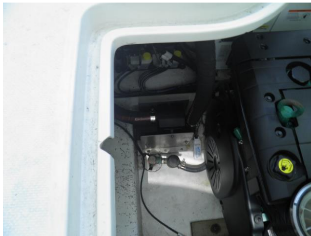
Engine mountings in good condition.