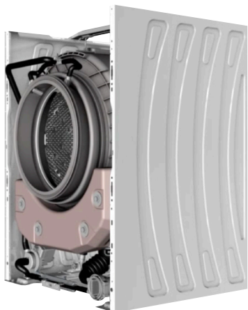
Boomerang Wall panels