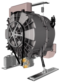
Digital Drive Motor