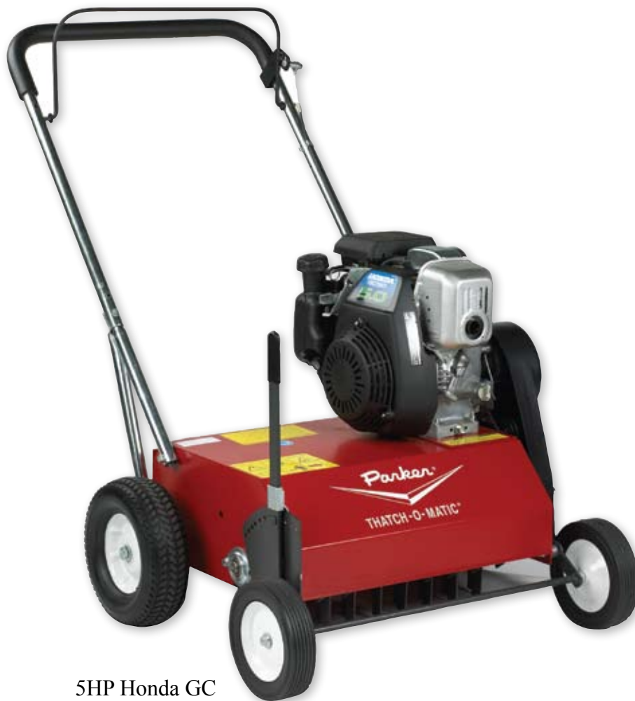
5HP Honda GC

Out Performs • Out Works • Out Lasts the Competition