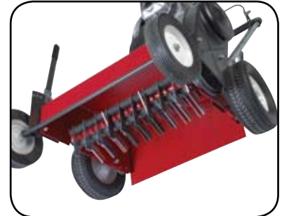
Safety Guard Rear Gate